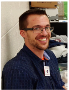
Fish Fry - February 28

April 4 - Tour of Knights Developmental Center